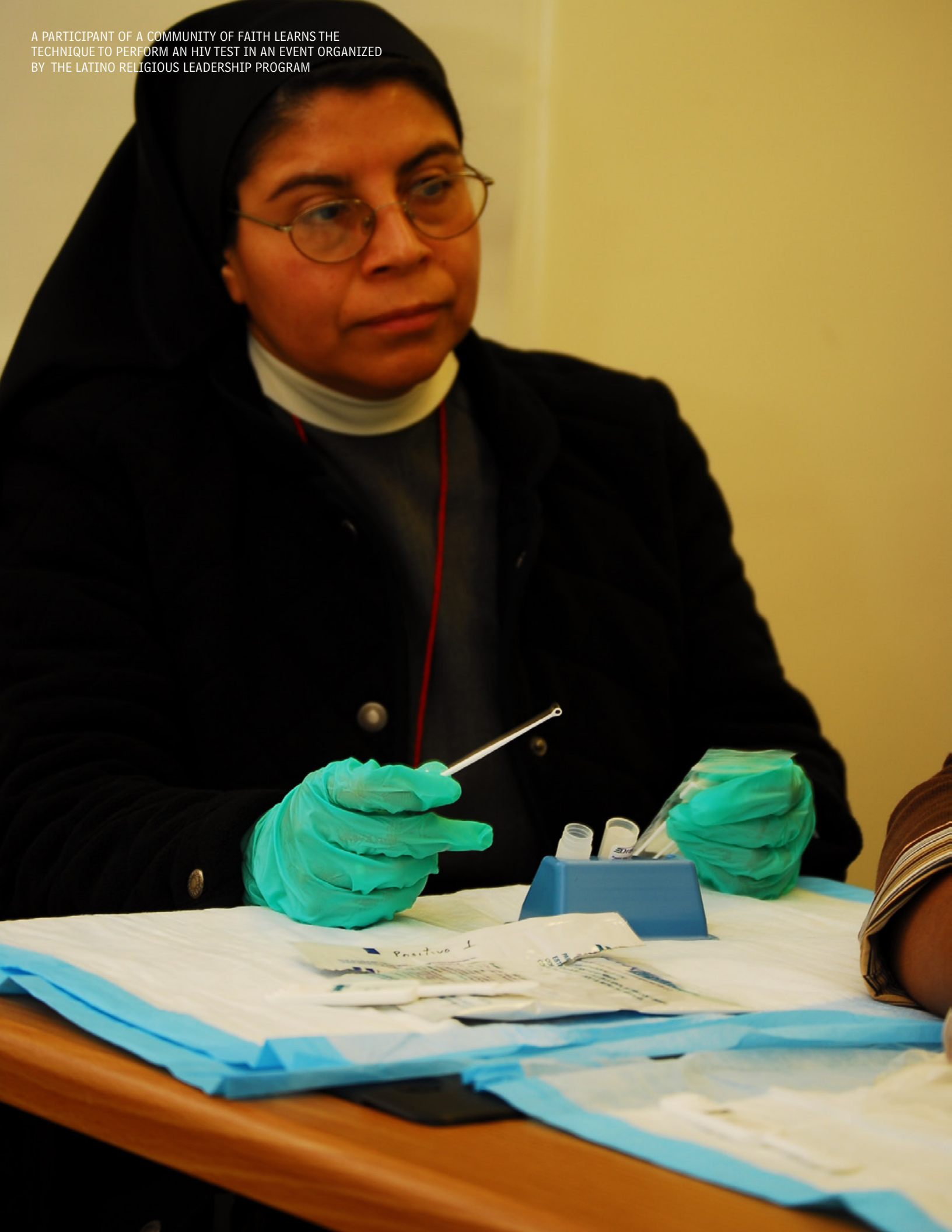
A PARTICIPANT OF A COMMUNITY OF FAITH LEARNS THE TECHNIQUE TO PERFORM AN HIV TEST IN AN EVENT ORGANIZED BY THE LATINO RELIGIOUS LEADERSHIP PROGRAM