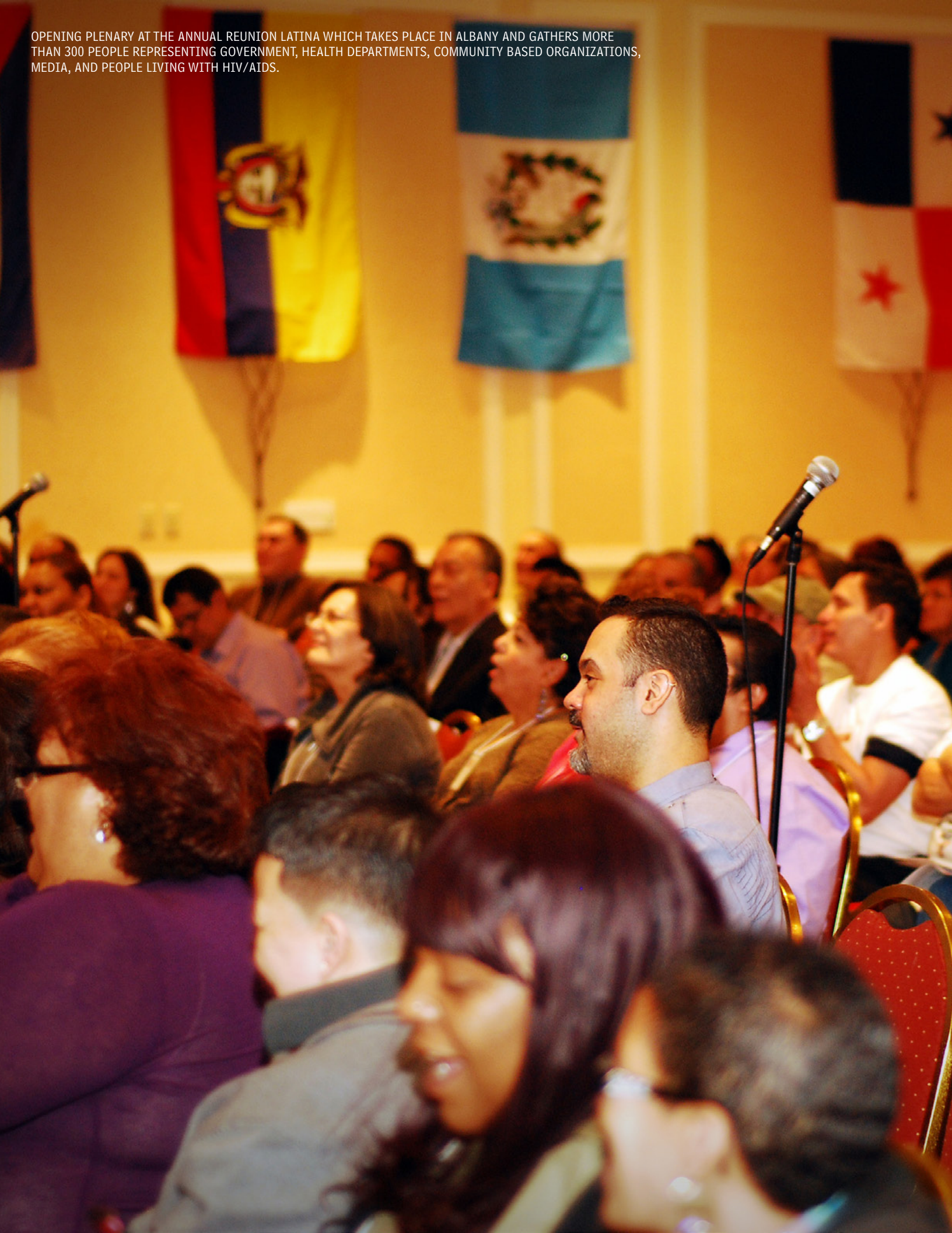
OPENING PLENARY AT THE ANNUAL REUNION LATINA WHICH TAKES PLACE IN ALBANY AND GATHERS MORE THAN 300 PEOPLE REPRESENTING GOVERNMENT, HEALTH DEPARTMENTS, COMMUNITY BASED ORGANIZATIONS, MEDIA, AND PEOPLE LIVING WITH HIV/AIDS.