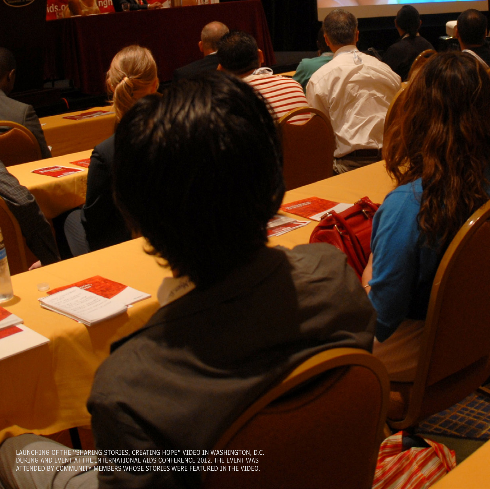
LAUNCHING OF THE "SHARING STORIES, CREATING HOPE" VIDEO IN WASHINGTON, D.C. DURING AND EVENT AT THE INTERNATIONAL AIDS CONFERENCE 2012. THE EVENT WAS ATTENDED BY COMMUNITY MEMBERS WHOSE STORIES WERE FEATURED IN THE VIDEO.